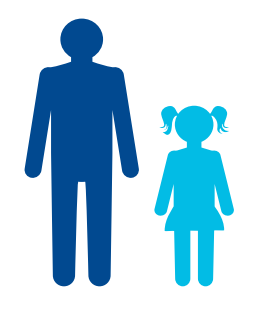
STARTING POINT: PARENT SUPERVISION RATIO FOR CHILDREN UNDER EIGHT SHOULD BE 1:2