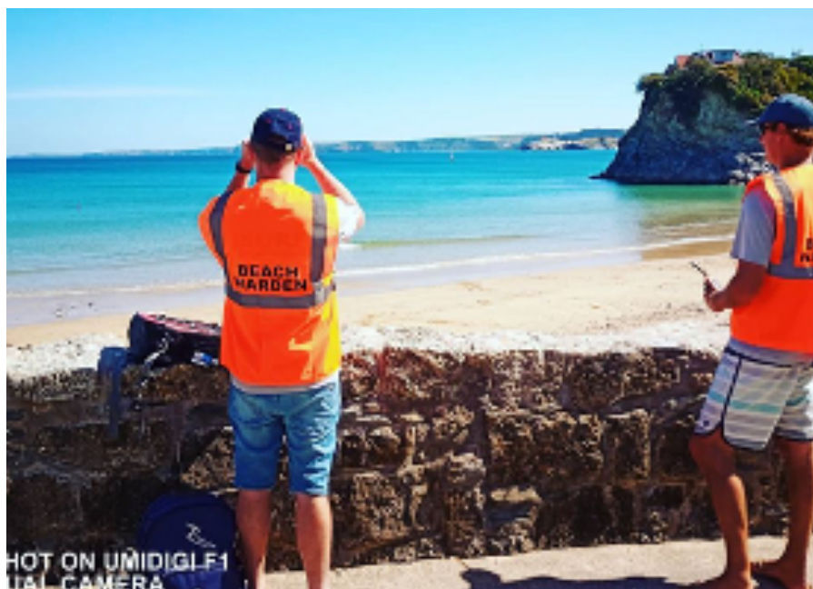
Image credit: Newquay Surf Lifesaving Club (@NewquaySLSC)Twitter 14

They are distinct from lifeguards; as such, there is no direction, provision or expectation for them to undertake a contact rescue, or provide first aid services for the public.